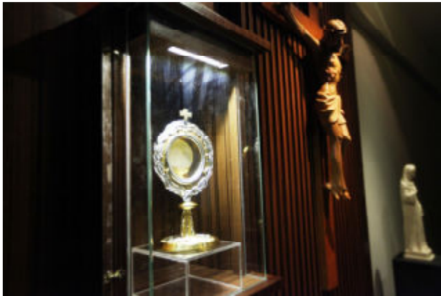
Blessed Sacrament for Adoration/Prayer