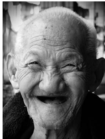
The aged and sick – are precious in God's eyes