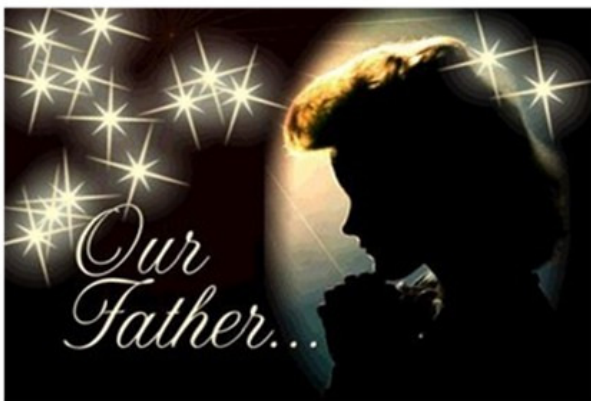
Opening our hearts to God in prayer