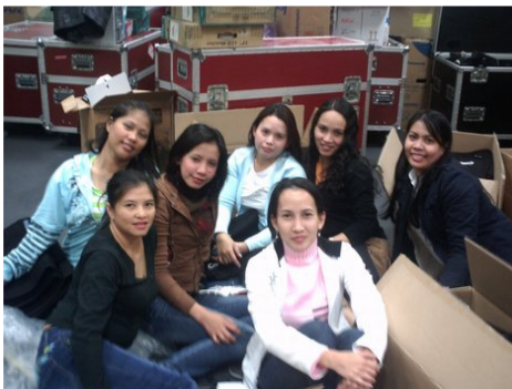
Filipino migrant workers – loved by God