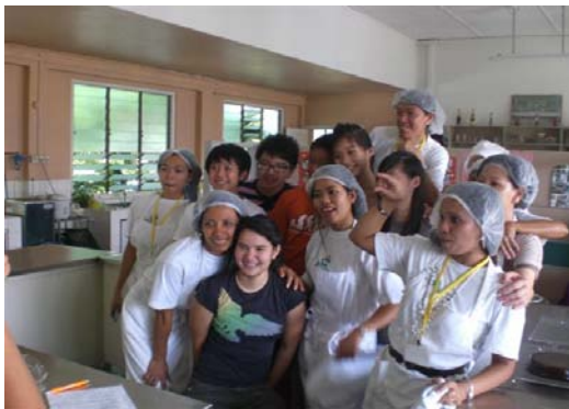
Sec 3 youth & migrant workers on service project at ACMI

The catechism programmes at our parish aim to help each young person to know, love and serve God as an integrated human person in mind and heart. We want to engage them in conversation to understand and explore the fundamentals and beliefs of our Catholic Faith, learn to reflect the strong sense of God's presence in their daily living, and to live the values of the Gospel in reaching out to people, especially the needy.