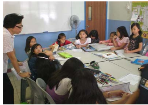
Primary 4 class in discussion