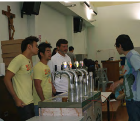
Beer and wine corners