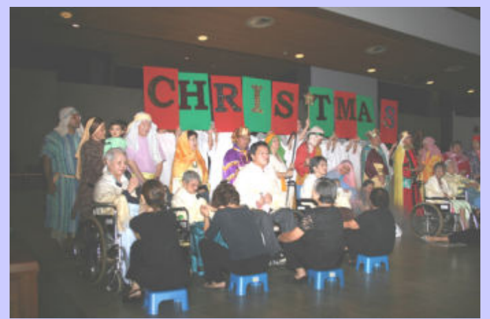
Pageant cast - aged and volunteers

Through this pageant our uncles and aunties remind us that life is more than having the physical strength and external beauty of youth, but ultimately, it is in having a deep faith in the Lord as our Saviour that gives us the true peace , and the real hope that begins now and lasts for all eternity.