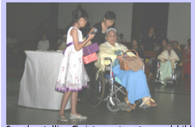
Grandma telling Christmas story to grandchild