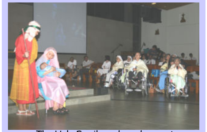
The Holy Family and aged as cast