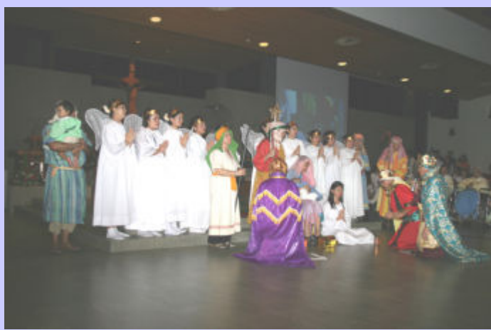
Pageant cast - Three wise men and angels

Most of the pageant cast are wheelchair bound; they are not only aged – some are 4 th stage cancer patients with a few months of life left, yet they took much pain and pride to learn their lines and sing their tunes, and delivered them with gusto and great joy in their hearts. They are symbols of hope in God for the world – like our late Pope John Paul II, they embrace their infirmity and illness with great dignity.