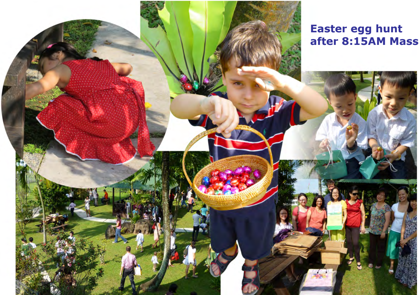
Easter egg hunt after 8:15AM Mass