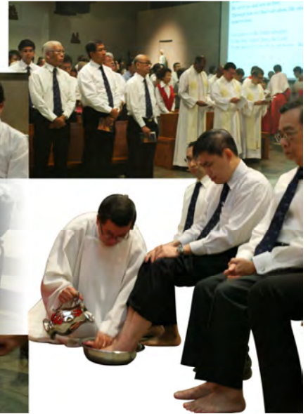
Top: Washing of the feet