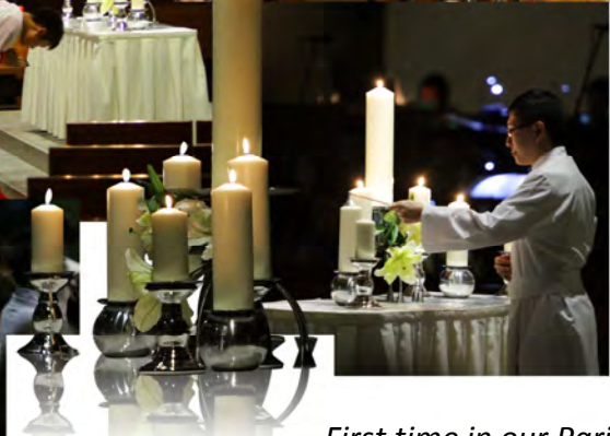
First time in our Parish church