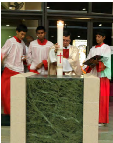
Blessing of Water