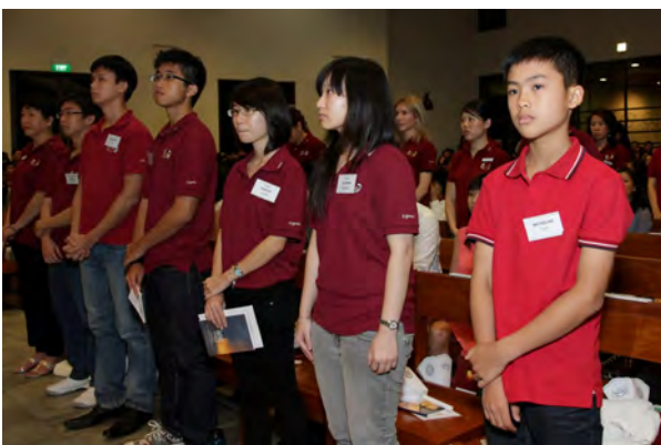
Newly Baptised - RCIY