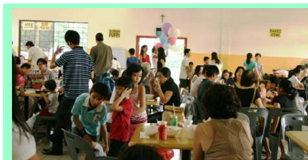
Families enjoyed home cooked food after Mass