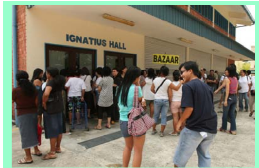
The crowd before the bazaar started

While we congratulate everyone who contributed towards a very successful Bazaar . . . we have to keep in mind that the Bazaar firstly fostered a better community spirit in our Parish; secondly, all our labour is truly worthwhile because the money raised will make so much difference to the poor and needy . . . many of them would benefit in terms of basic needs, of food, shelter, water, education, medical treatment, and the like. A Parish Social Committee will be set up to manage all the funds raised and you will be informed of the amount. In addition, full documentation will be kept of all projects supported by our Social Mission funds