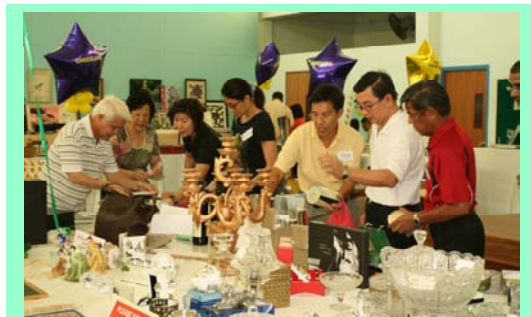
Preparing the auction section....

It is impossible to mention and thank every group and person who contributed to the Bazaar project, but special thanks must be accorded to the main committee members viz. the Bazaar Planning/Task Force Team and the Bazaar Finance Committee. They laboured selflessly (often behind the scenes), for 6-7 weeks . . . some of them with very little sleep during the last days before the Bazaar, thereby ensuring that all logistical needs were attended to. My deep gratitude to them.