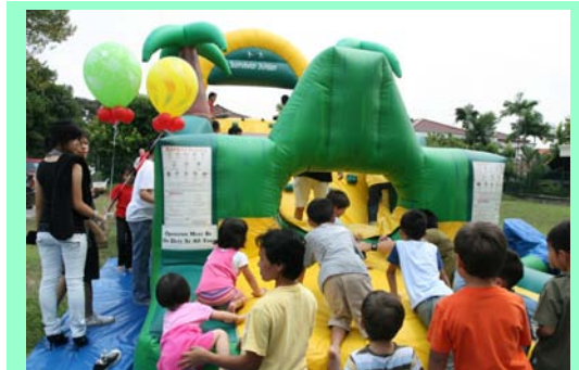
Children enjoyed themselves!

The Social dimension of our Parish celebration was experienced through our Parish Bazaar project to raise funds for the poor and needy. Many parishioners participated in different ways: through selling coupons, their generous donations of sale items and cash, buying coupons, cooking/donating food for sale, selling potted plants, minding of stalls and counters, providing many varied services, too many to name, including health-therapy, painting and magnetic buttons, traffic control and clearing of the balance of bazaar items from St Ignatius hall etc. Many who volunteered their services are parishioners who are not in ministries and I am sure they were enriched by their contribution to our parish's on-going Social Mission Goal.